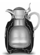
Fig. 1: Vacuum carafe with stainless steel insert

alfi Top Therm vacuum carafes and vacuum flasks keep drinks at their proper temperature for hours. They consist of a shell with an unbreakable double-walled stainless steel insert (Fig. 1) or an unbreakable double-walled stainless steel body (Fig. 2 and 3). A vacuum is created between the stainless steel walls. This vacuum prevents direct heat transfer for consistently high vacuum insulation performance.